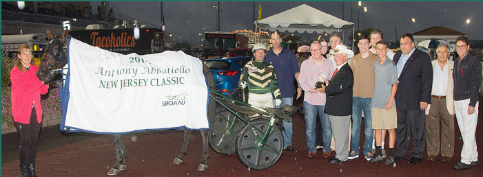
Winner circle presentation of the Abbatiello Classic

The spotlight was on New Jersey sired three year old pacers Saturday night, July 30th, at the Meadowlands. Blue Moon Stride continued her winning ways by dominating the $85,000 Thomas D'Altrui for 3 year old fillies. Don'tcallmefrancis nosed out the competition in the $150,000 Anthony Abbatiello Classic.