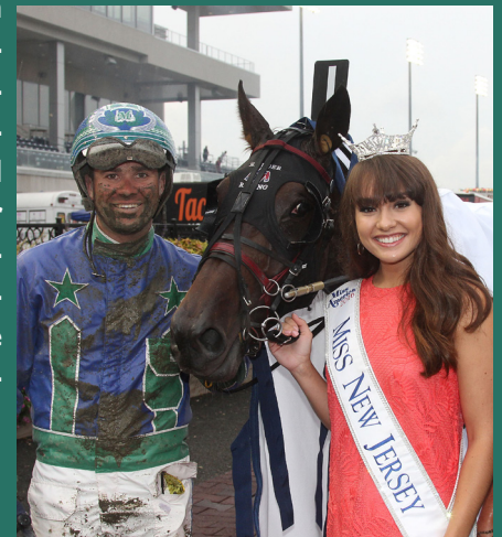
Miss NJ winner circle presentation